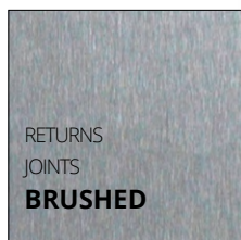
RETURNS JOINTS BRUSHED