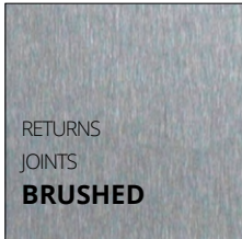
RETURNS JOINTS BRUSHED